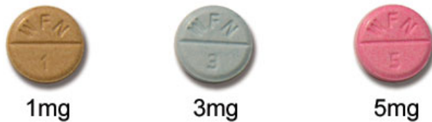
Figure 1: Example for colour coding of different strengths of warfarin tablets in the UK.